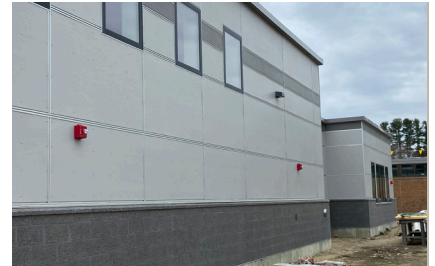
Above: Exterior finishes