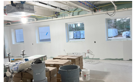
Above: Painted 1st floor classroom stocked with floor tile